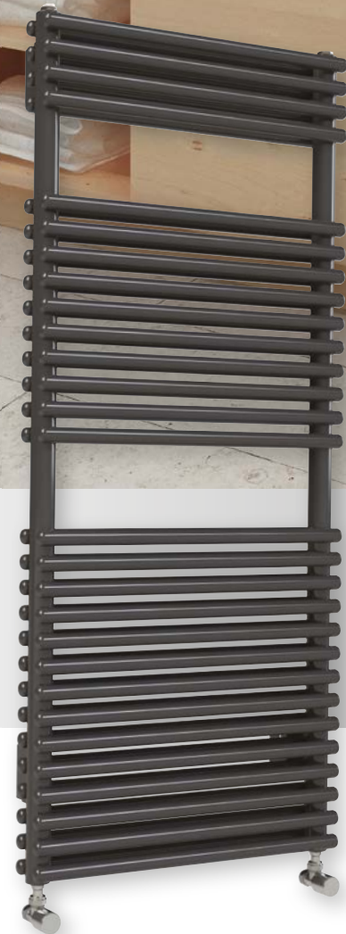
RAL 7016 Anthracite

Choose from a range of decorative valves to complement TOPAZ.