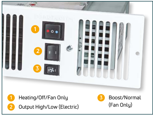
*DUO = Electric/Hot Water