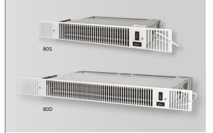
*Due to a component supply issue, the KICKSPACE® 600E model is temporarily unavailable.

The KICKSPACE® 80S and 80D are a lower height and suitable for Ikea and European style kitchen units. They have all the features of the KICKSPACE® and come in a single and double width for extra output.